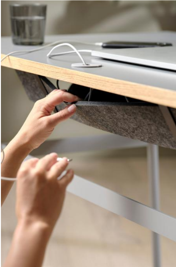
FELT CABLE MANAGEMENT