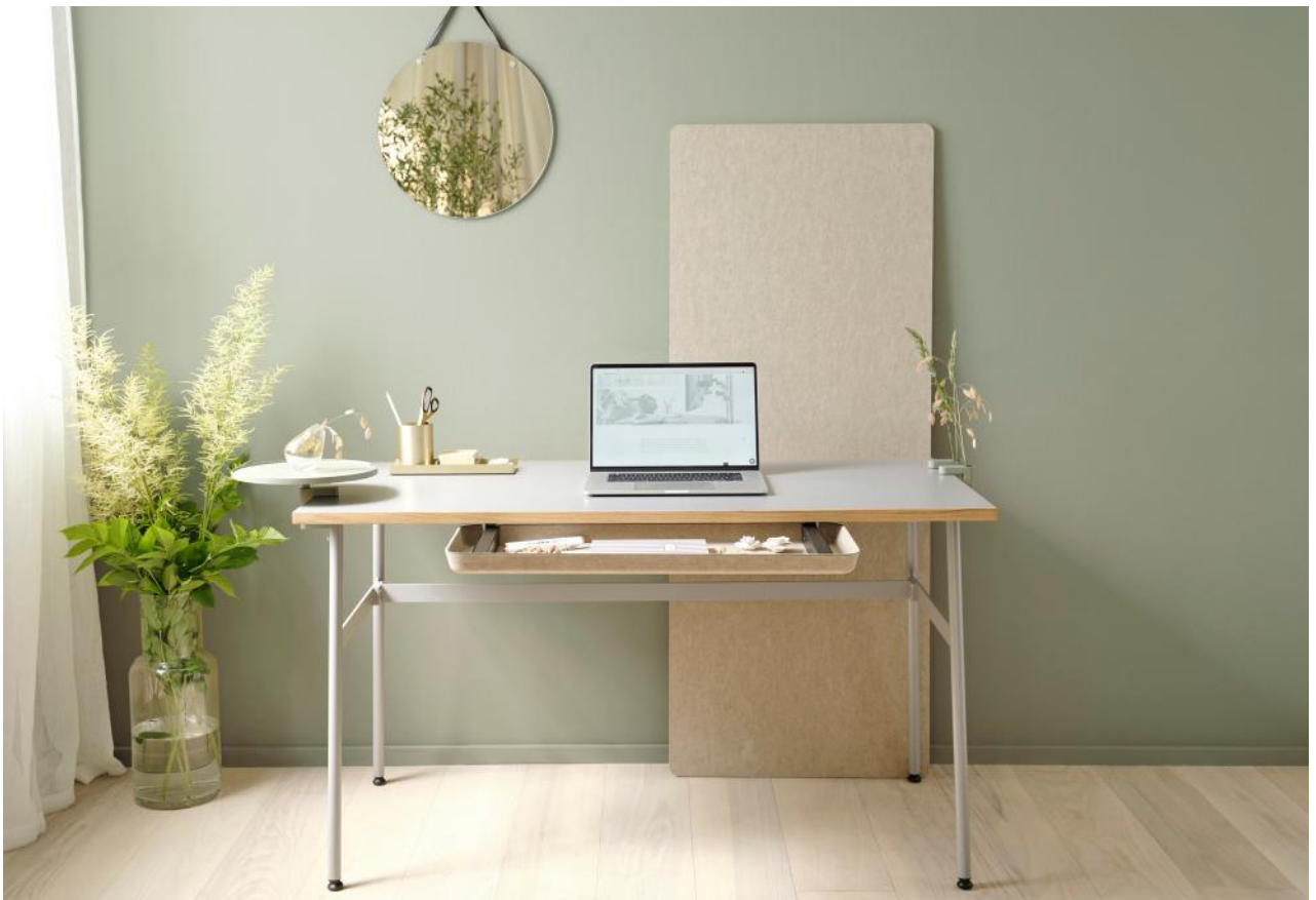
FELTDRAWER SLIM BEIGE