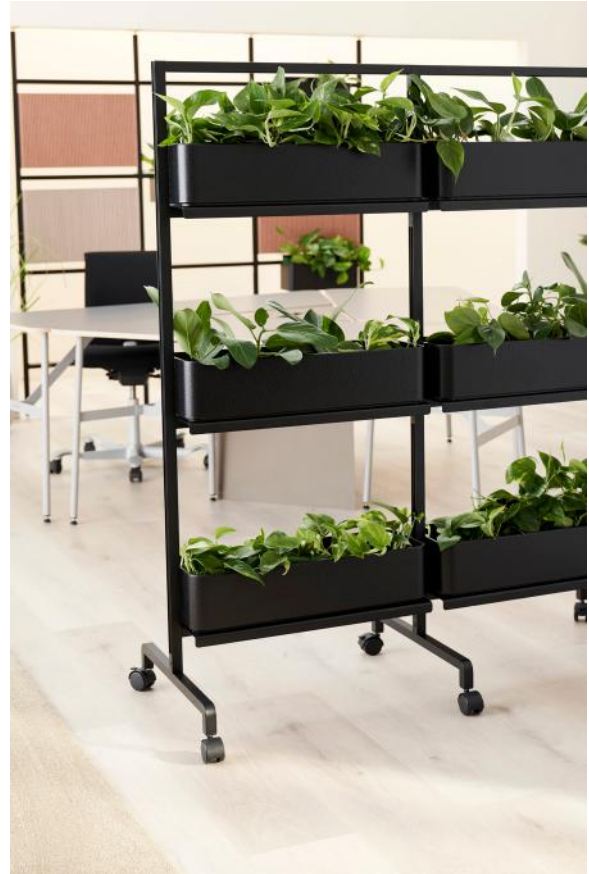
EXTEND FREE STANDING