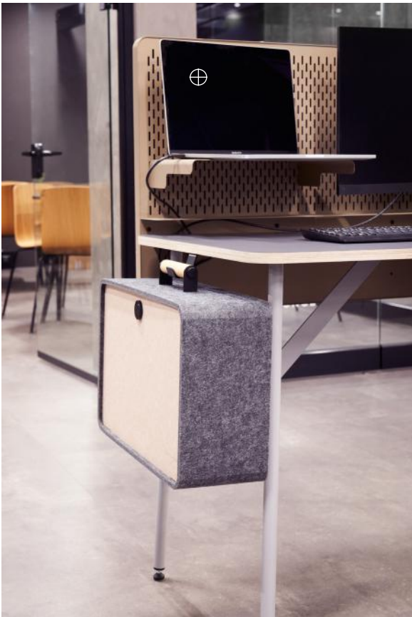
⊕ ADAPT BOARD WITH LAPTOPSHELF