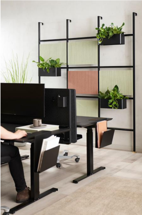
EXTEND WALL MOUNTED