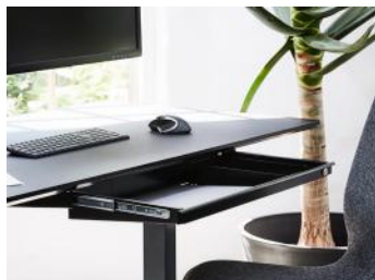
LAPTOP DRAWER >>