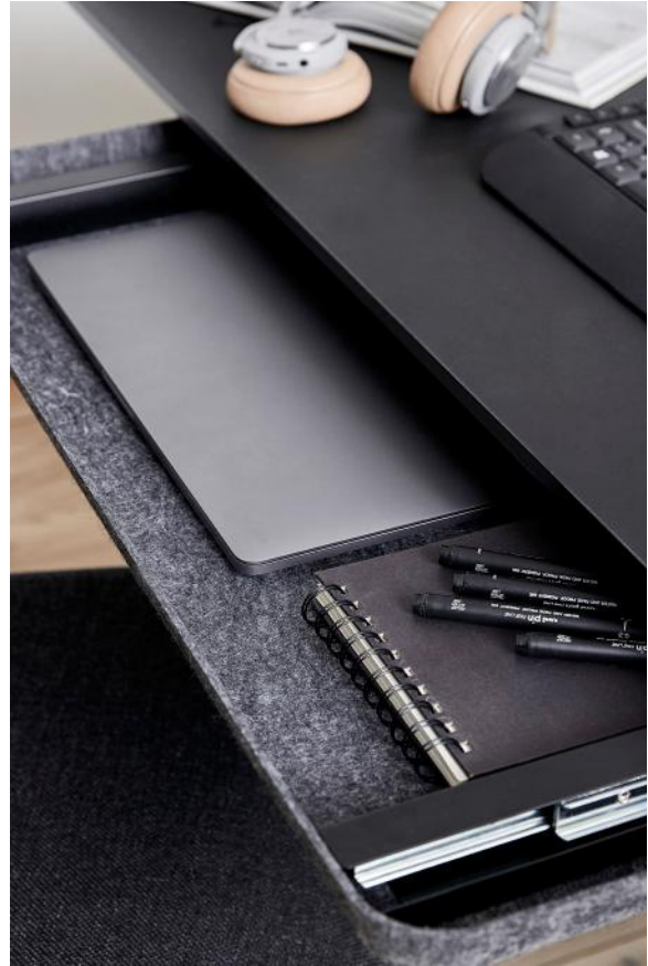
FELT DRAWER LARGE DARK GREY