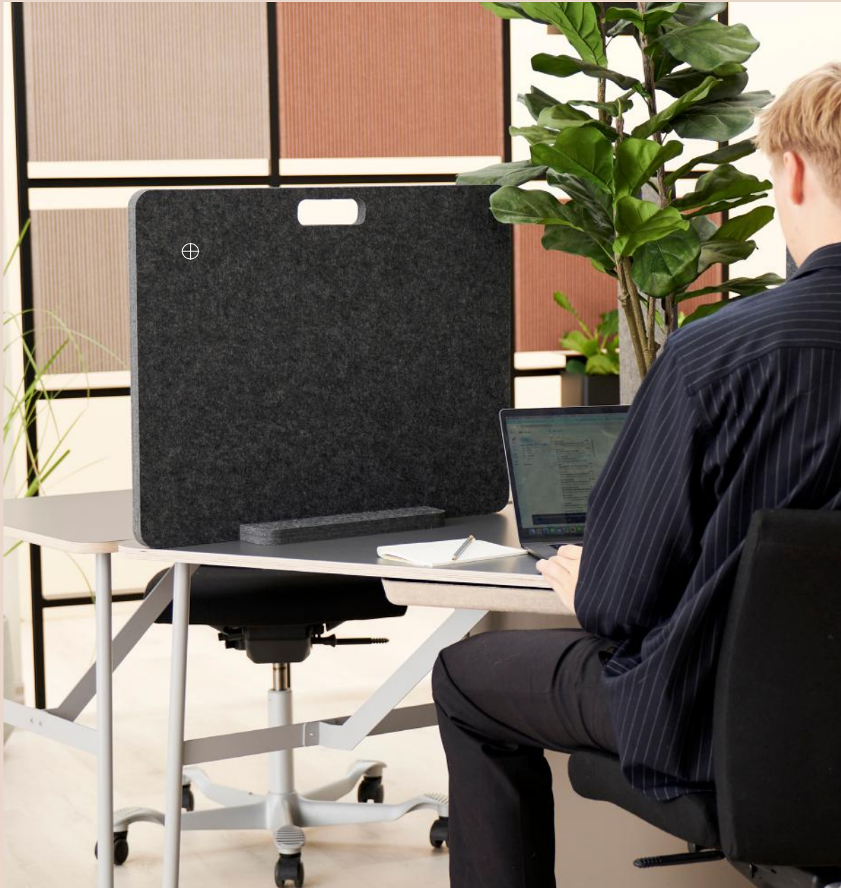
⊕ TRANSPORTABLE DESK DIVIDER