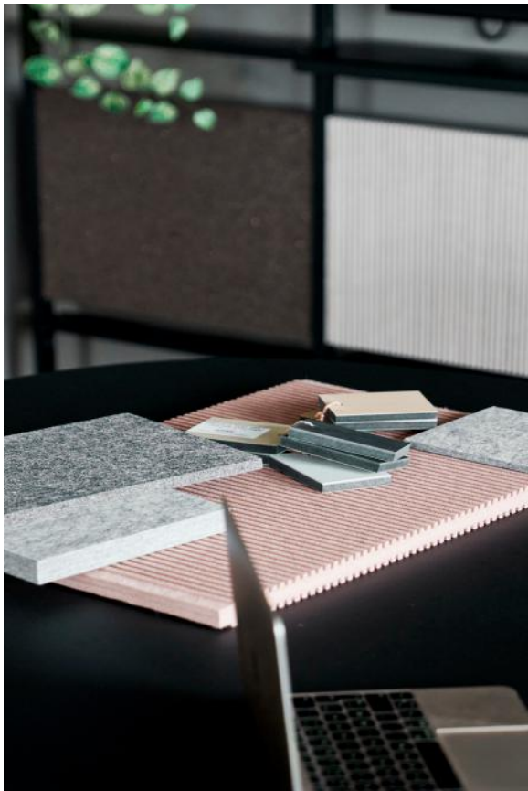
FELT PANEL RECYCLED