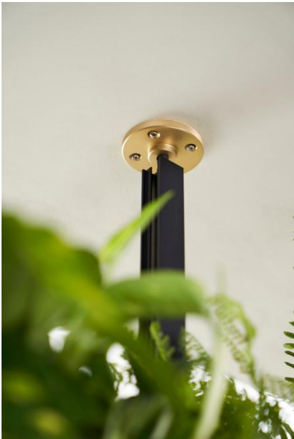
EXTEND CEILING MOUNTED