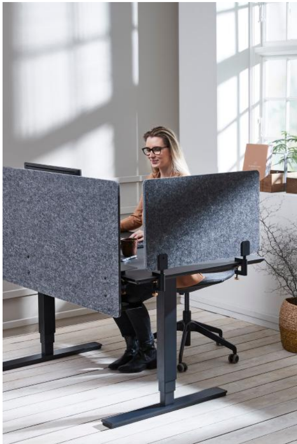
CLAMP CABLE MANAGEMENT AND SIDEWALL