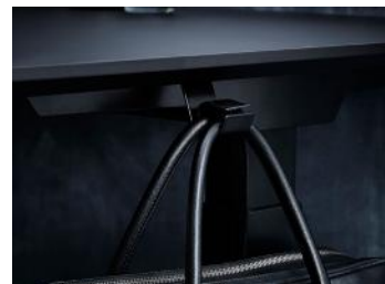
SATCHEL HOOK >>