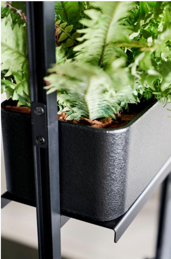
FLOWER BOX RECYCLED

Modules that can be easily rearranged without the need for tools.